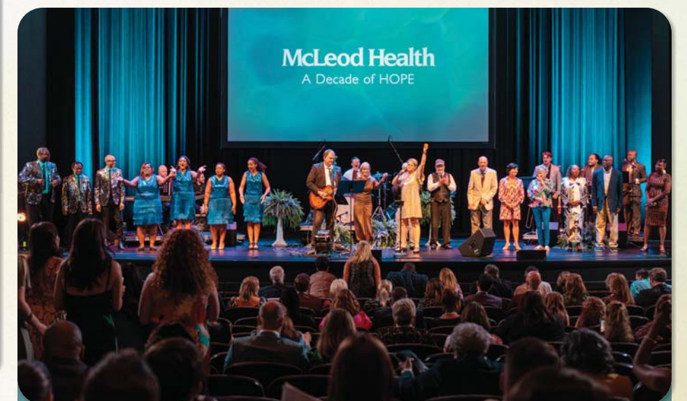
During the finale of the 25th Annual Cancer Benefit An Evening of Hope , celebrity guest performers and the featured cancer survivors joined the Emerald Empire Band on stage for the song, "Don't Stop Believing."