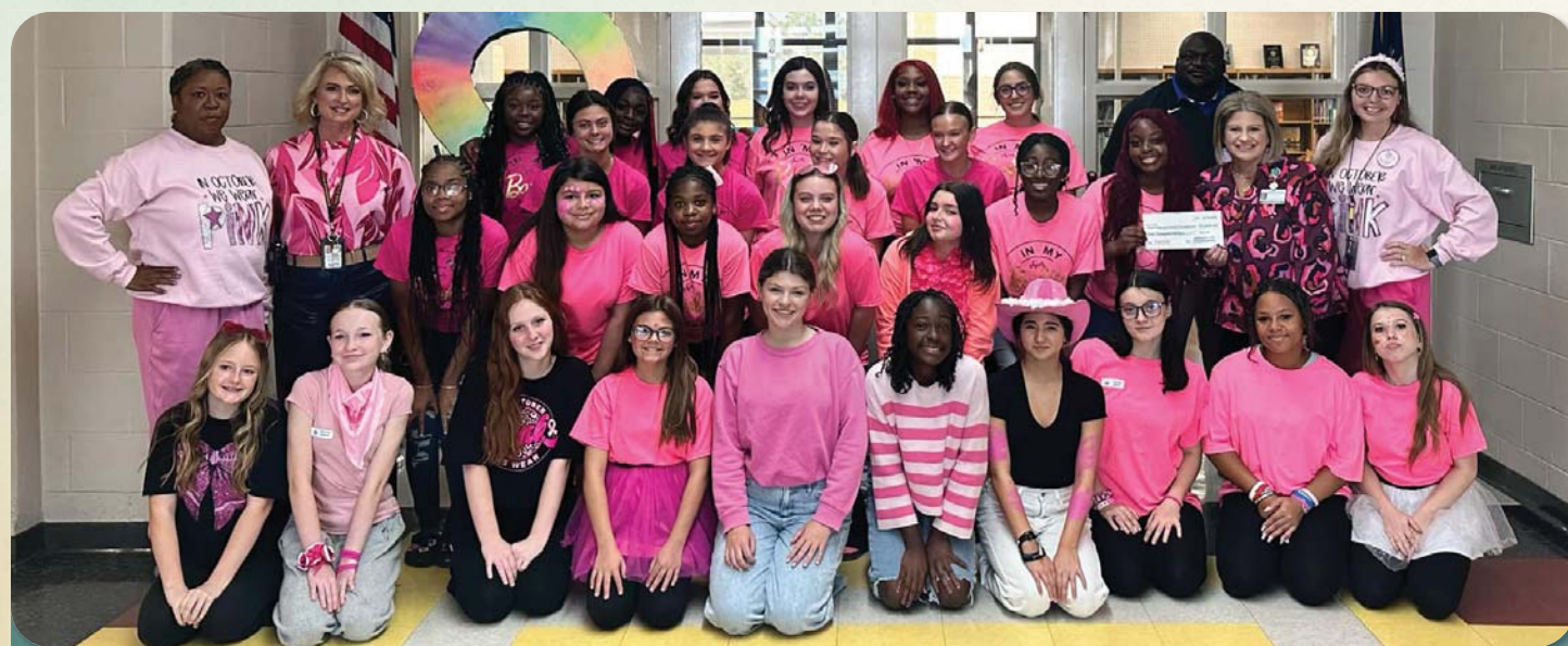
Students and staff with Johnsonville Middle School raised money to support Mammography Scholarships at McLeod Health through their "Fun Run for Cancer."