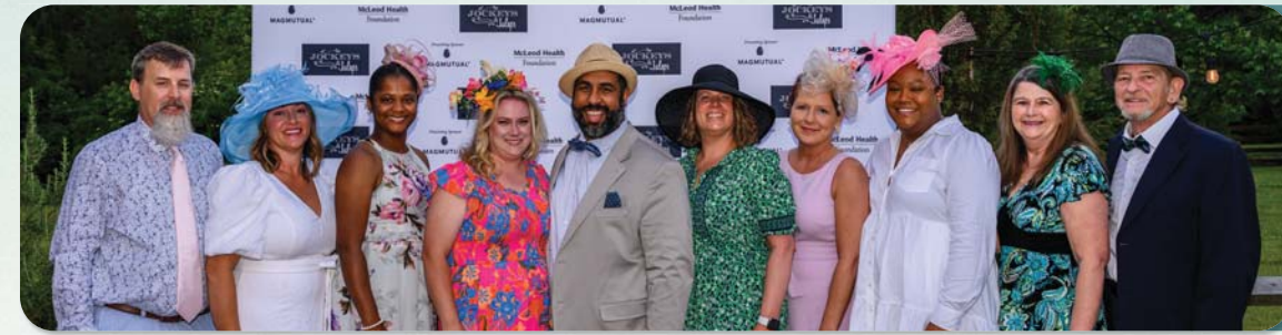
The fourth annual Jockeys & Juleps fundraiser was held in May 2024 at Slate & Cypress. Pictured at the event are members of the McLeod Oncology and Hematology Seacoast team.