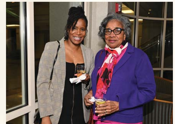
2024 Foundation Events PAGE 16