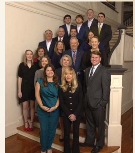
Local Firm's Stewardship Leads by Example PAGE 11