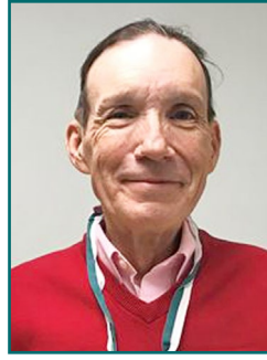
Gary Moore Environmental Services January 2019