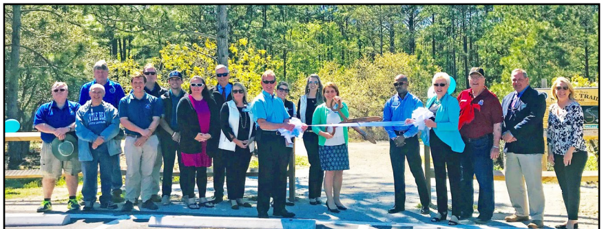
Local community leaders gathered for the ribbon cutting ceremony of the McLeod Health Seacoast Nature Trail at the North Myrtle Beach Park & Sports Complex on April 16.